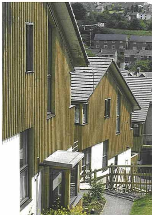
TOP LEFT & MIDDLE Social housing contractor United House states that assumptions about the levels of embedded carbon in building products still have to be made TOP RIGHT Architype's Stroud Co-housing project uses a timber frame construction