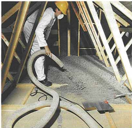
BELOW Warmcel insulation is manufactured from recycled newspaper and is claimed to be a better than carbon zero insulation